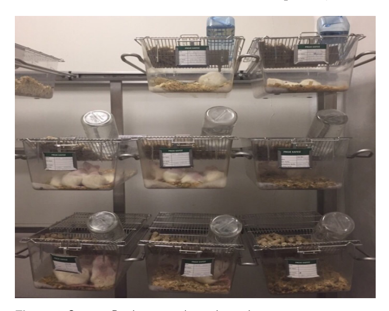
Figure 1. Sprague-Dawley rats and experimental groups.

In this study, 48 female Sprague-Dawley rats which ranging in weight from 150 to 200 grams were used. Experimental study was carried out with 14 numbered approval of Istanbul Medipol University Animal Experiments Local Ethical Committee. Rats were obtained from Istanbul Medipol University. During the quarantine, rats were kept at a stable temperature (23 \pm 1 °C) for 12 hours. Also, they were kept for 12 hours in light and for 12 hours in dark. They were fed with standard rat food and allowed to reach water (tap water/ad libitum) (Figure 1).