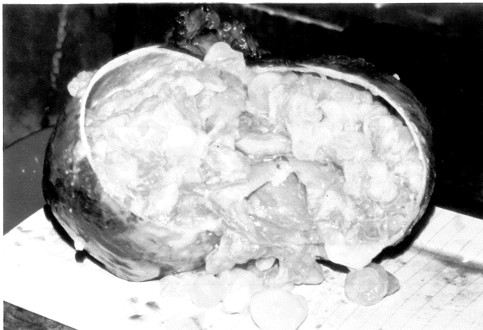
Fig.2. Hydatid cyst showing multiple daughter cysts on excision